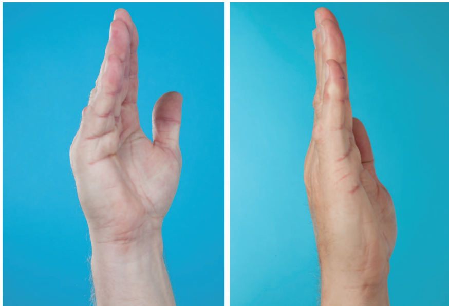
Fig. 3. Preoperative ( left ) and postoperative ( right ) views of a 63-year-old man who underwent percutaneous needle fasciotomy of the fifth digit of the right hand.