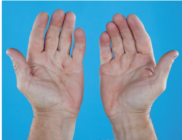
Fig. 1. Anteroposterior view of a 61-year-old man who was treated with limited fasciectomy in the fourth digit but suffered from extension in the fifth digit after 5 years.